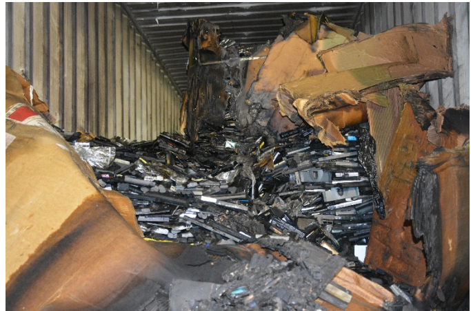
Burnt lithium batteries in fiberboard boxes.

On August 19, 2021, a container illegally loaded with discarded lithium batteries caught fire while enroute to the Port of Virginia. The container was being transported on a chassis from Raleigh, NC, intended for a maritime voyage to a port in China via a foreign-flagged container ship. The batteries caught fire on the highway resulting in loss of the cargo, and significant damage to the shipping container. Upon initial investigation, the responding fire department determined that the heat produced from the fire burned hot enough to create a hole through the metal container's structure. In addition, the bill of lading listed "computer parts," not lithium batteries. This is a situation that made responding to the fire more challenging and could have been potentially catastrophic had the container caught fire after being loaded aboard the container ship.